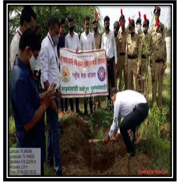
NSS Programme officer planting a tree

[Signature] Programme Officer Natinal Service Scheme New Arts Commerce & Science College Tal. Shevgaon, Dist. Ahmednagar