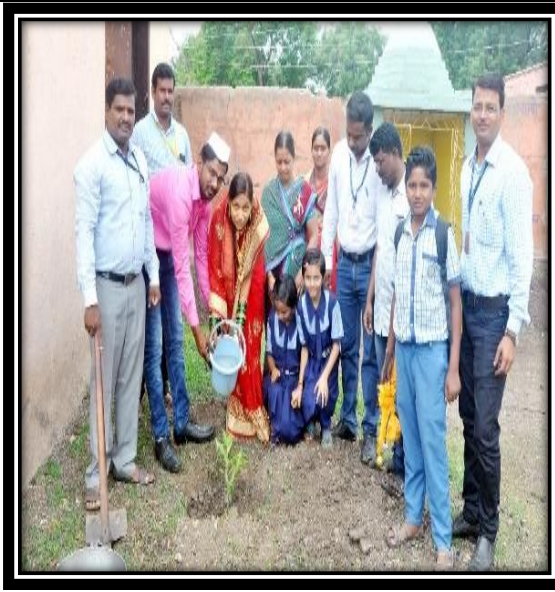
NSS Volunteers Planting tree