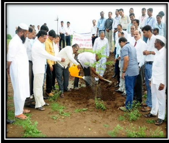
Tree Plantation at Miri Road