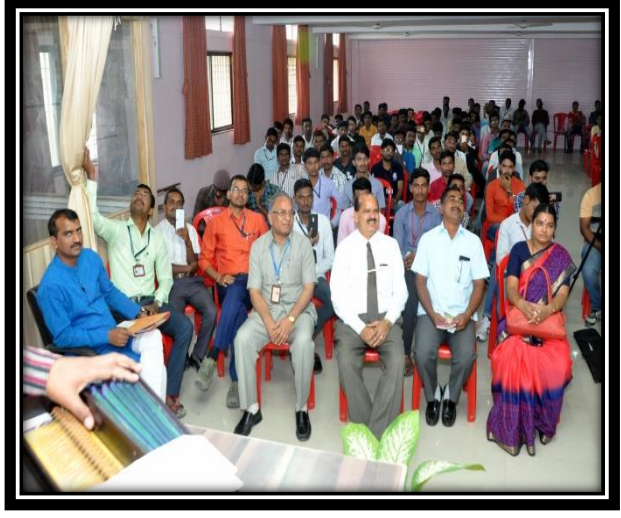
Participants of the program

[Signature] Programme Officer National Service Scheme New Arts Commerce & Science College Tal. Shevgaon, Dist. Ahmednagar