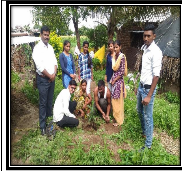
NSS Volunteers Planting tree