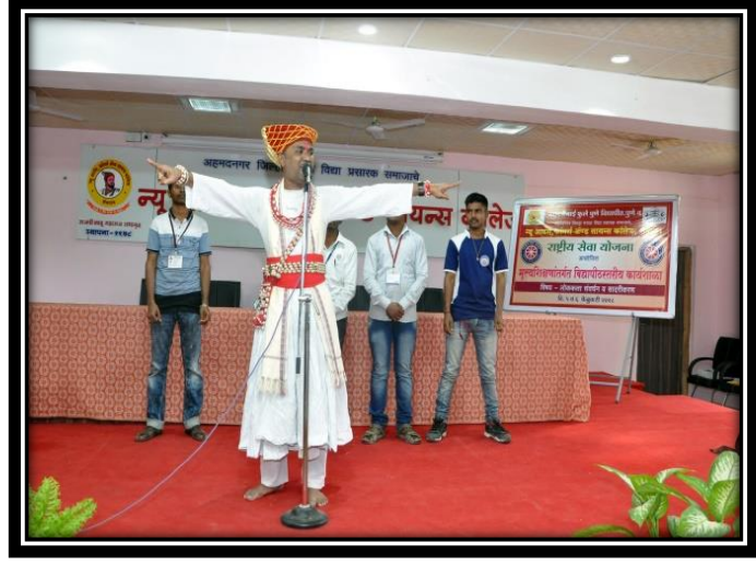
Representation of Folk art