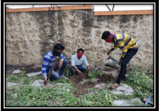
NSS Volunteer planting a tree